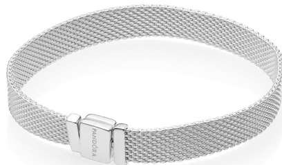
PANDORA Reflexions™ Bracelet