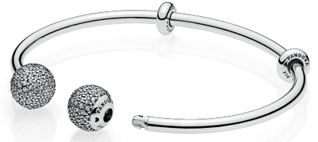
Open Bangle Bracelet