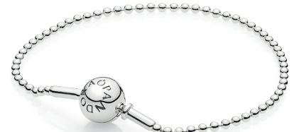
ESSENCE COLLECTION Beaded Bracelet