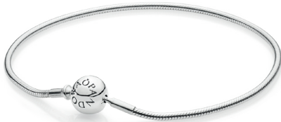
ESSENCE COLLECTION Bracelet