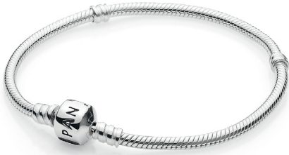
Classic Charm Bracelet